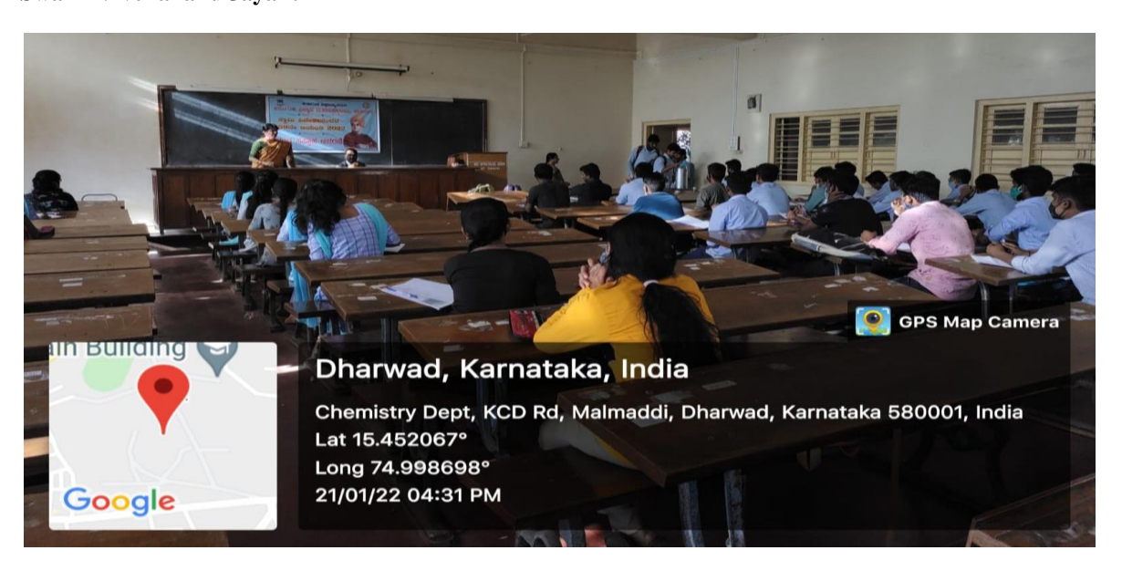
Various Cultural Program organised on the occasion of Swami Vivekanand Jayanthi